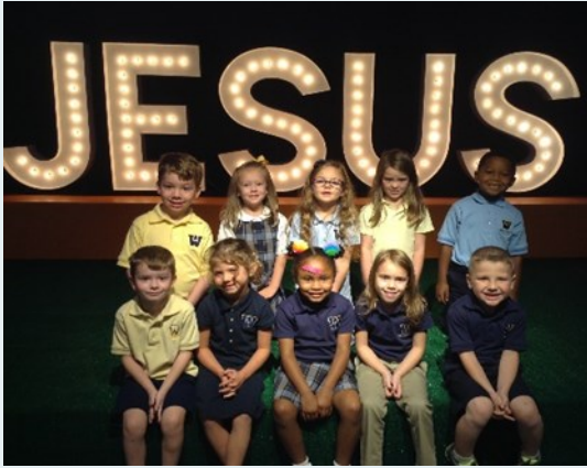
The new kindergarten class at East Campus pose for a picture in Chapel the first week of school.

Elementary students have had a great start to the new school year with many activities!