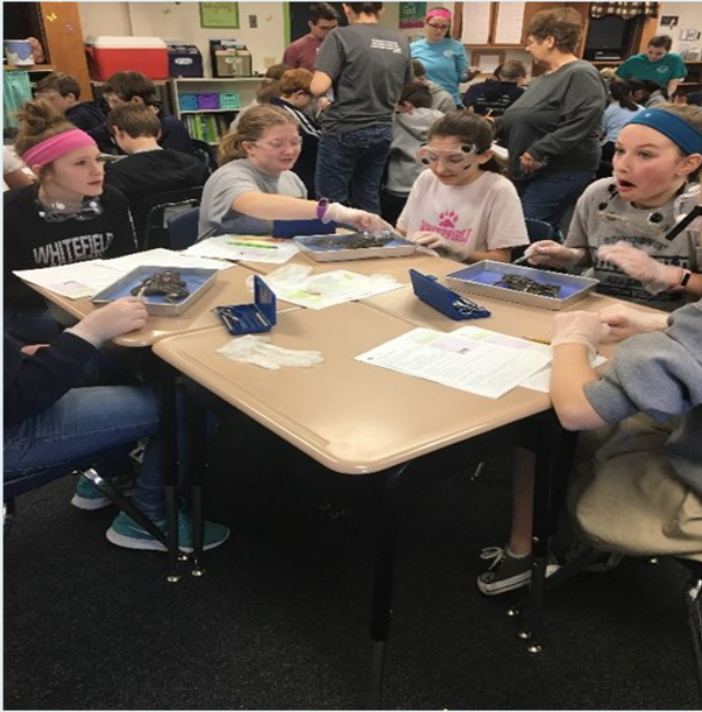
The seventh grade students dissected frogs on Friday, March 10, 2017.