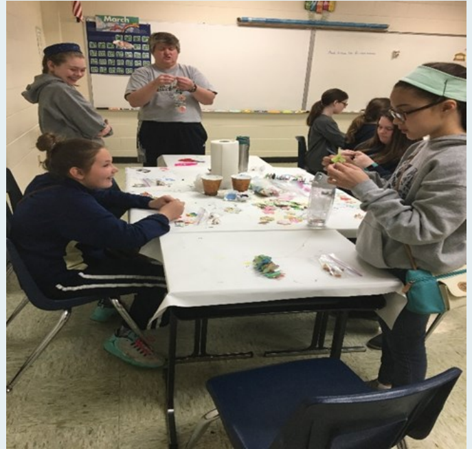
Sixth graders working on various craft projects during Middle School Creative Learning Day.