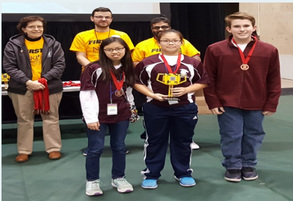
Team Fearless Minds – 1 st place Programming Award and 7 th place robot performance.