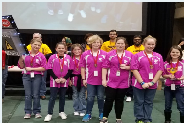
Team Circuit Breakers – 2 nd place Gracious Professionalism Award, 3 rd place robot performance.