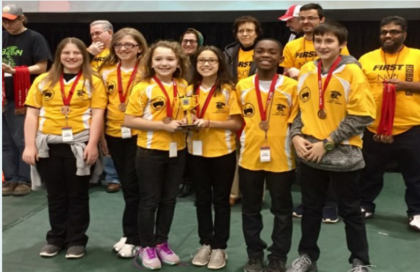
Team EMOJICS – 2 nd place Innovation and Strategy Award.

Congratulations to the four Whitefield Academy Elementary and Middle School teams which competed in the Kentucky State FLL Robotics tournament on Sat., February 4 th hosted by Northern Kentucky University.