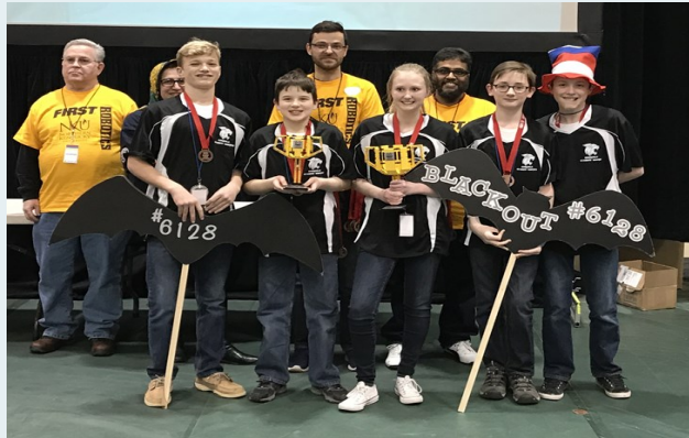
Team Blackout – Kentucky State Champions Award, 1 st Place robot performance.