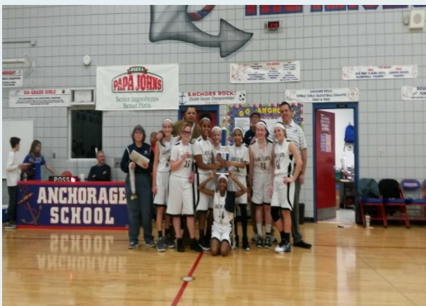
Middle School girls' basketball team winning the Anchorage tournament in February, 2017.